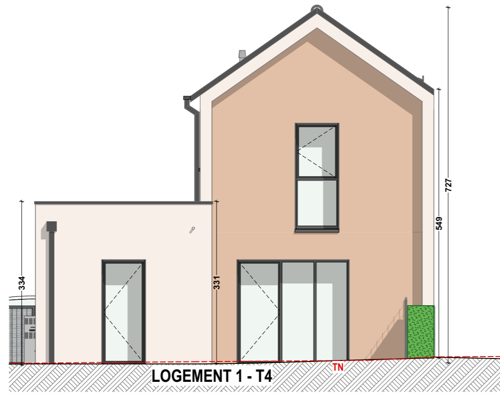
LOGEMENT 1 - T4